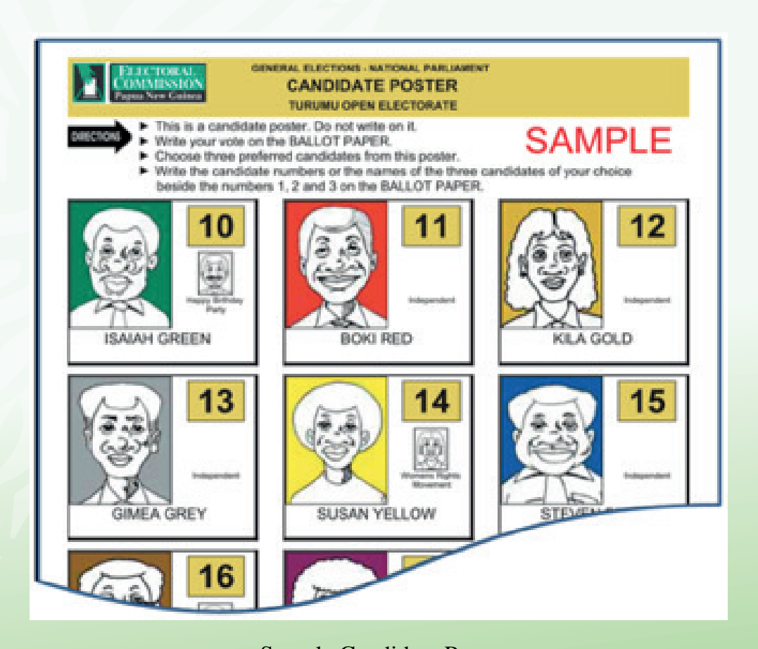
Sample Candidate Poster